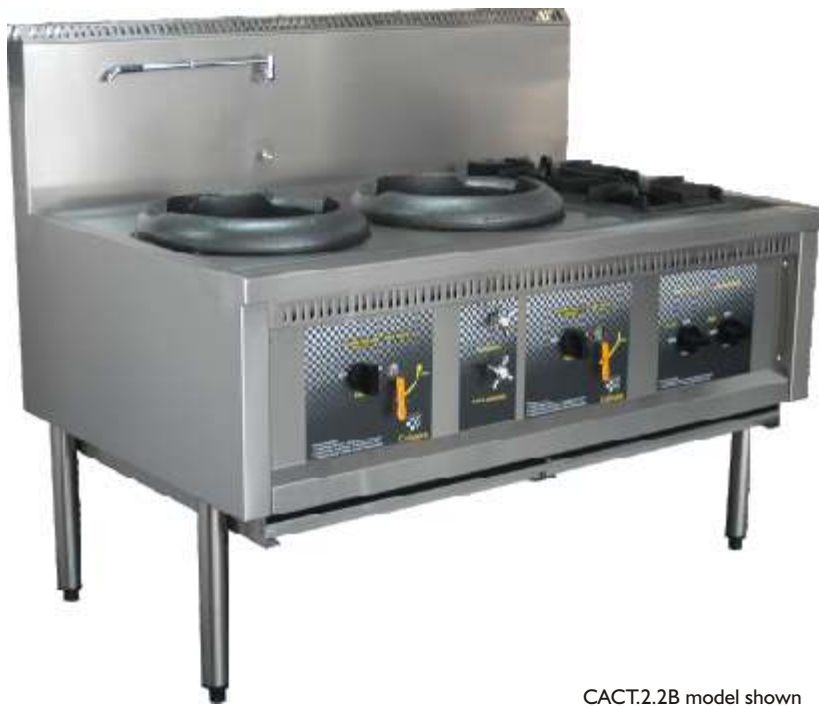
CACT.2.2B model shown